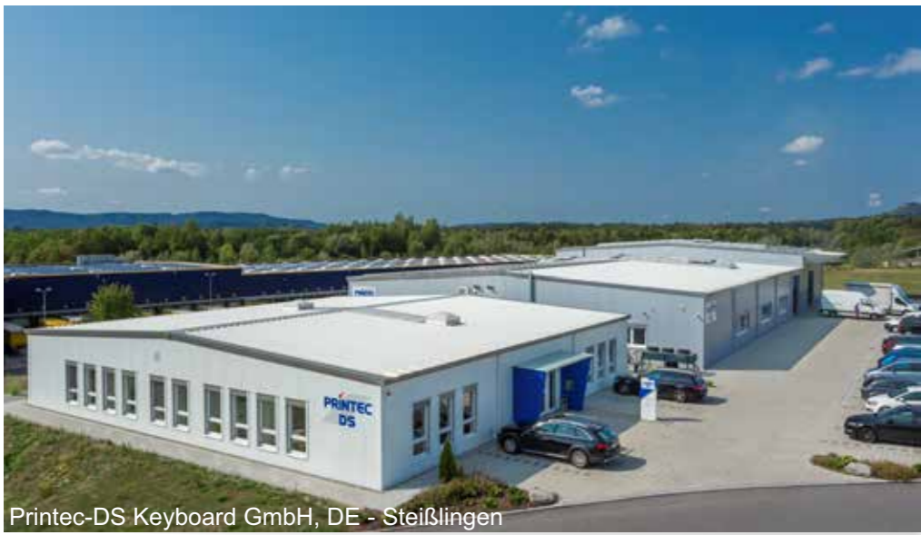
Printec-DS Keyboard GmbH, DE - Steißlingen