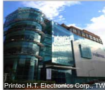
Printec H.T. Electronics Corp., TW