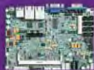
PEB-2771 D525, Fanless