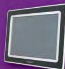
EUDA Series IP65