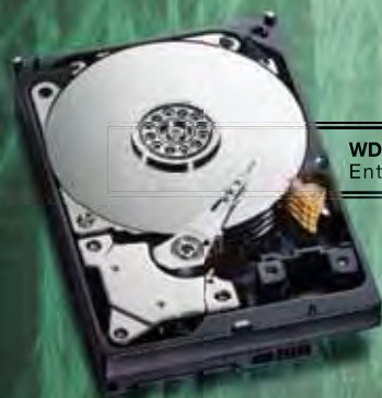
WD RE4-GP Enterprise Hard Drives