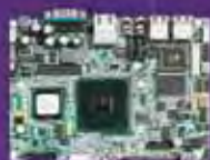
PEB-2739 US15WPT, -40~85 °C